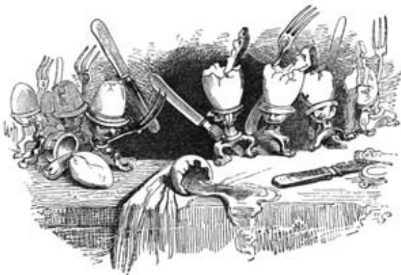
Carnage at the breakfast table is the outcome of the war between the Little-Endians and the Big-Endians. (The engraving, from the 1838 edition of Gulliver's Travels , is by J. J. Grandville.)

An International Lisp Conference was held at Stanford a year ago. This was a gathering of the faithful, and naturally there was talk about how to bring enlightenment to the rest of the world. It was also an occasion showing that even advocates of the same language are